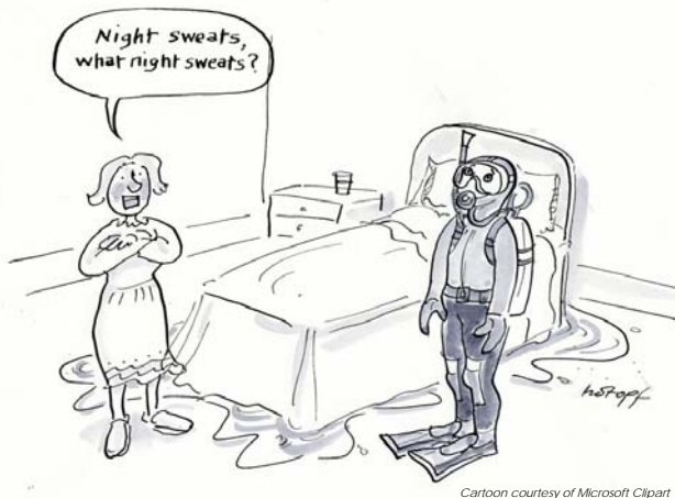
Cartoon courtesy of Microsoft Clipart

obese and overweight women had fewer VMS.